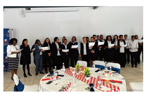
Above: Nurses in the Rustenburg Region celebrated International Nurses Day.

Platinum Health (PH) wish to express its sincere gratitude for the dedication, commitment and perseverance that PH nurses have displayed over the past year. Nurses are the backbone of our healthcare system and vital to all the services