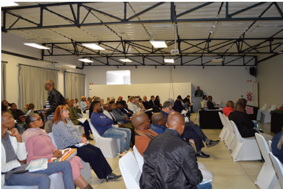
Above: Platinum Health's Annual General Meeting held on 30 June 2023 was well-attended.

The group financial statements for 2022 as well as the Board of Trustees Report was unanimously accepted. After the meeting was concluded, members had the opportunity to spend time with the Platinum Health staff and management, whilst enjoying a cup of tea and something to eat.