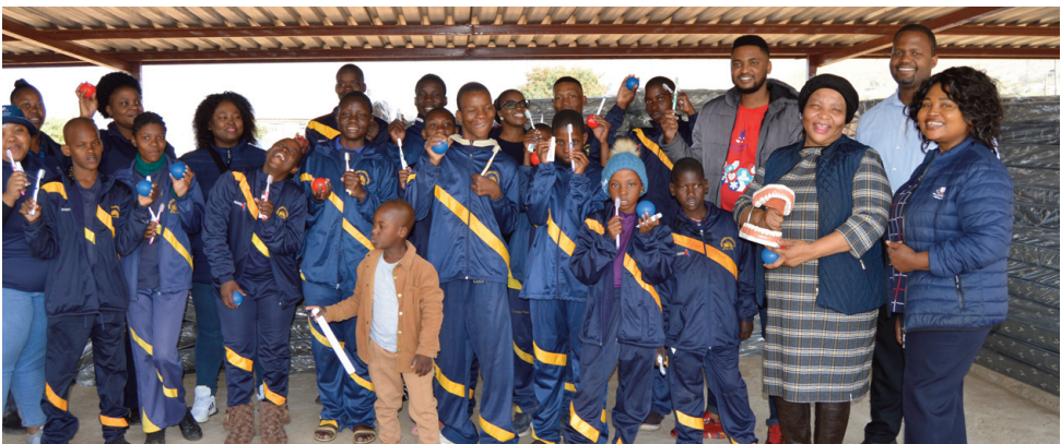
Above: Judging by the smiles on their faces, the children from Rehlahleng Special School were overjoyed with their gifts.

serve and for which we wanted to do something special for on this day. We are thankful for what the school does for its learners in empowering them to improve themselves. We hope that our contributions today will assist you to be better and help your learners,” he said.