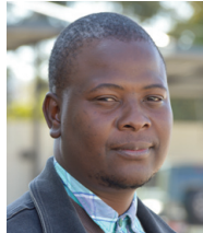
Siphon Patluza Mkhonto Amandelbult Platinum Health Constituency 3