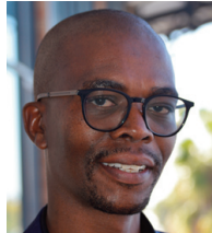
Bafana Lekoro Royal Bafokeng Platinum Constituency 4