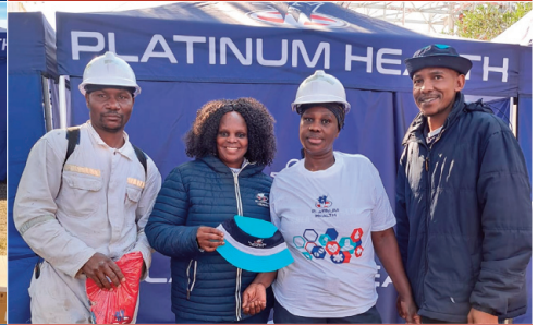
RST Special Metals