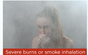
Severe burns or smoke inhalation