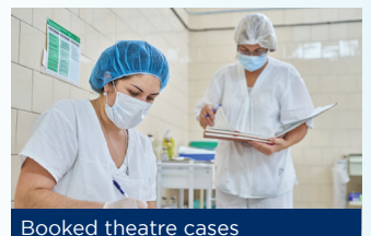
Booked theatre cases